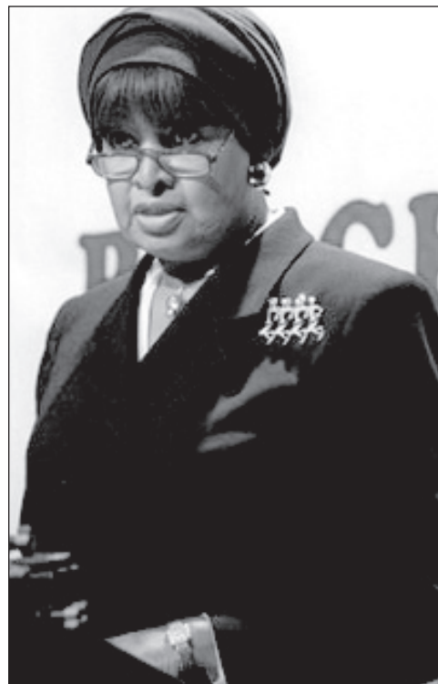
C DeLores Tucker

Tucker used her position to lead Pennsylvania toward becoming one of the first states to enact the Equal Rights Amendment to the Constitution.