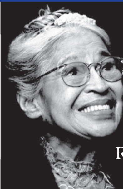
Rosa Parks Remembered Page 14