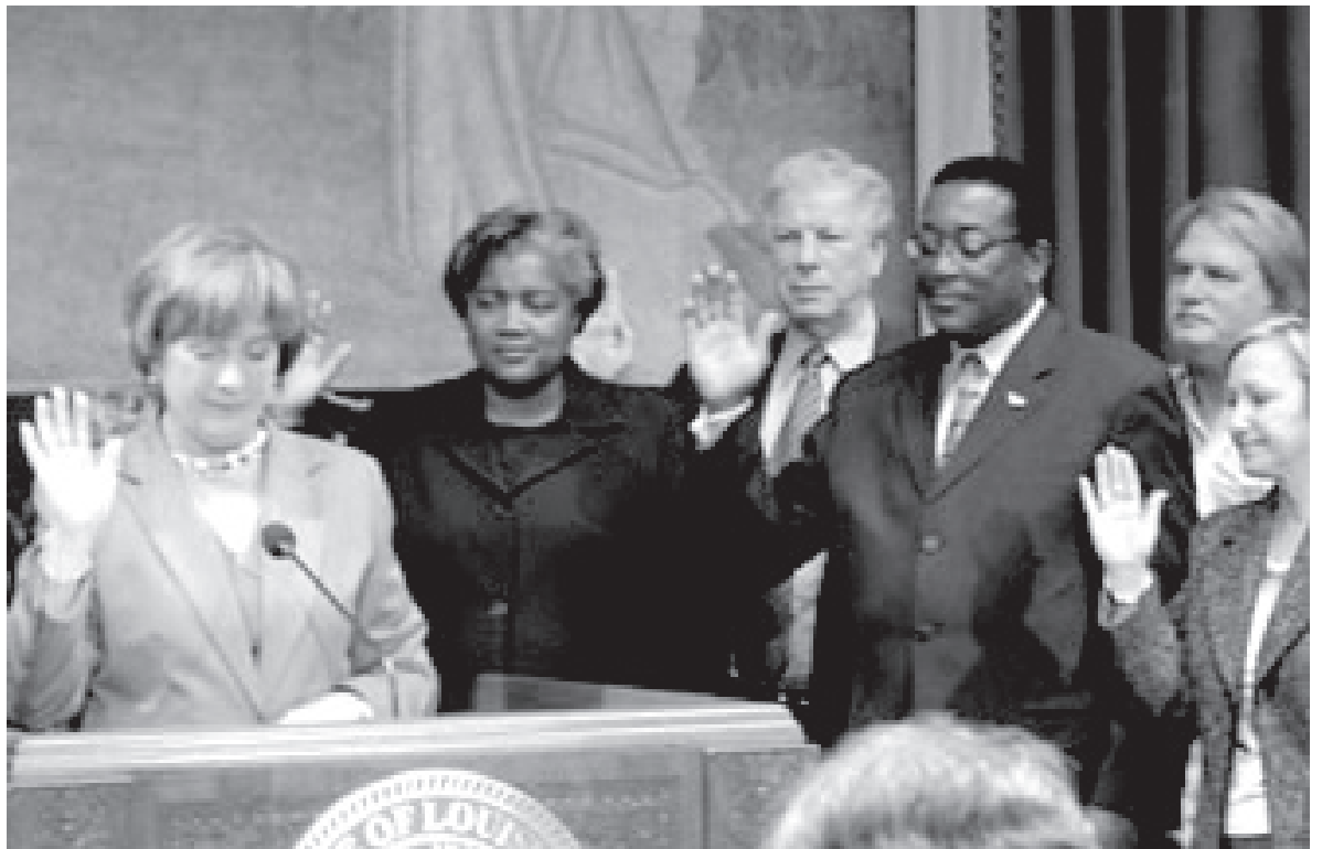
Louisiana Governor Kathleen Blanco swears in the Board of Directors for the Louisiana Recovery Authority.

Governor Kathleen Babineaux Blanco this week announced the creation of the Louisiana Recovery Authority as the guiding agency to lead the state's rebuilding efforts. The authority will focus on key state issues such as housing, jobs, transportation, healthcare and education.