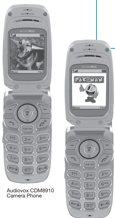
Audiovox CDM8910 Camera Phone