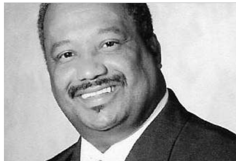
Pastor Fred Luter, Jr. Data Columnist