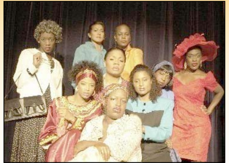
The cast of Brewster Place

Special note: May 3, Sunday's performance will be at 8:00 pm. ONLY! Tickets are $20.00 for adults, $17.00 for students and seniors, and are available by calling the Box Office at (504) 862-7529. (Box Office Hours are Tuesday-Saturday, 2-6 pm. and two hours before performances.) You may also charge by phone or charge