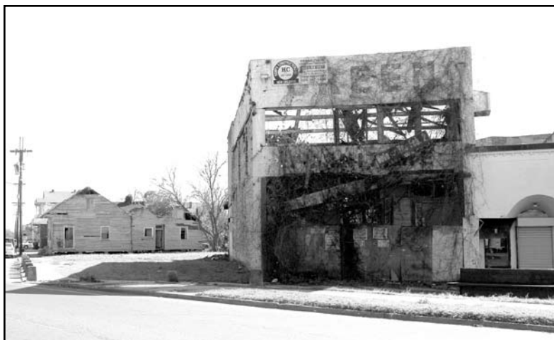
In some parts of the 7th Ward, blight is still a problem.