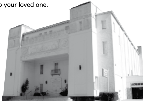
3933 Washington Avenue

Remember, we are only a phone call away.