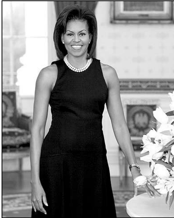
First Lady Michelle Obama

echoing the sentiments of many who said Mrs. Obama had acquired a powerful presence in London.