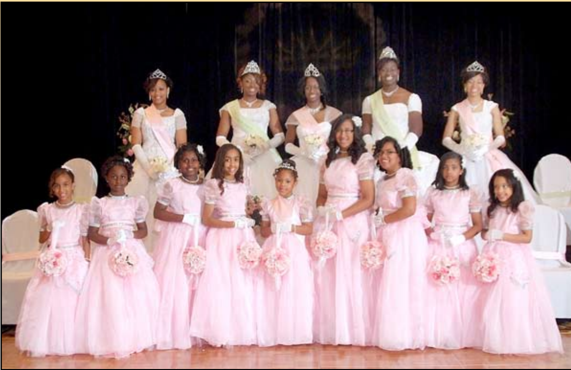
The 2009 Omicron Lambda Omega Cotillion Court.

Omicron Lambda Omega's 2009 Cotillion Season came to an end on Saturday, March 28 with the 5th Annual Cotillion Ball held at the Convention Center Marriott in the Blaine Kern Ballroom. The Cotillion showcased five debutantes and nine princesses.