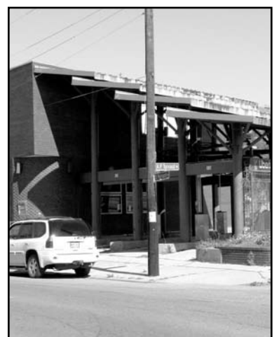
This was once a thriving facility opened for business prior to Hurricane Katrina.