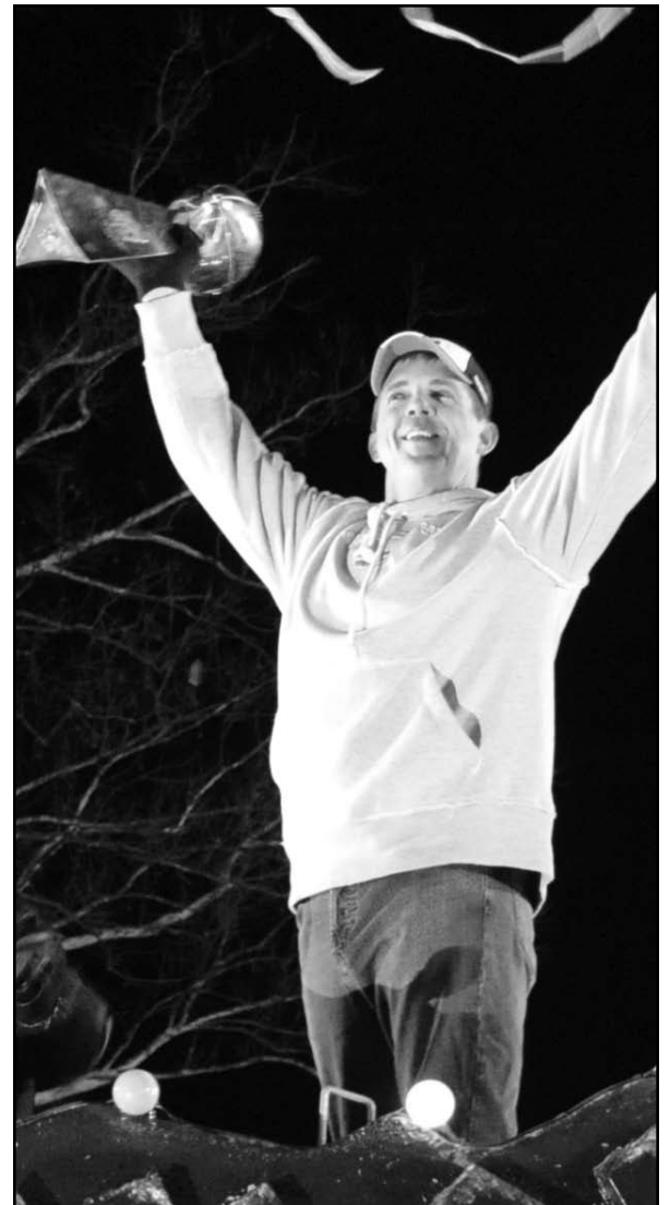
Saints Coach Sean Peyton holds the Vince Lombardi Super Bowl Trophy

Brees, to take the first lead of the game for the Saints. Time for the route, right, no we are playing Peyton Manning. Well with 6:15 left in the third quarter Joseph Addai from LSU ran in from 6 yards to put the Colts up 17 (which is the points I predicted they would get) to 16 headed into the fourth quarter.