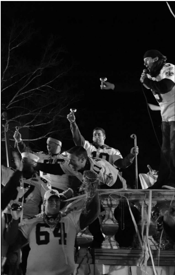
The Saints Toast themselves and New Orleans

Cover Story, Continued from previous page.