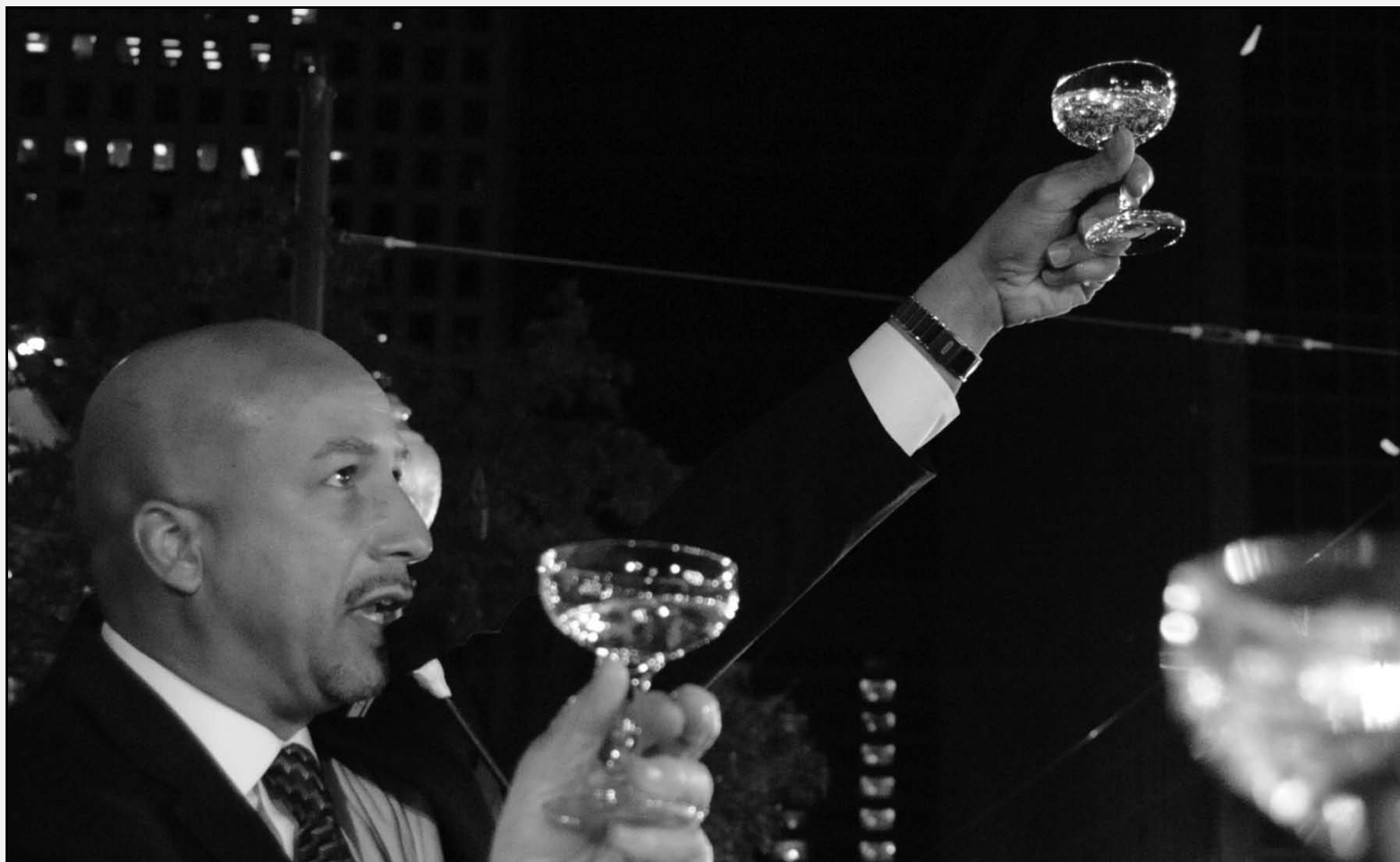
Mayor Ray Nagin Toasts the 2009 Super Bowl Champions, New Orleans Saints at the Victory Parade on Tuesday evening.