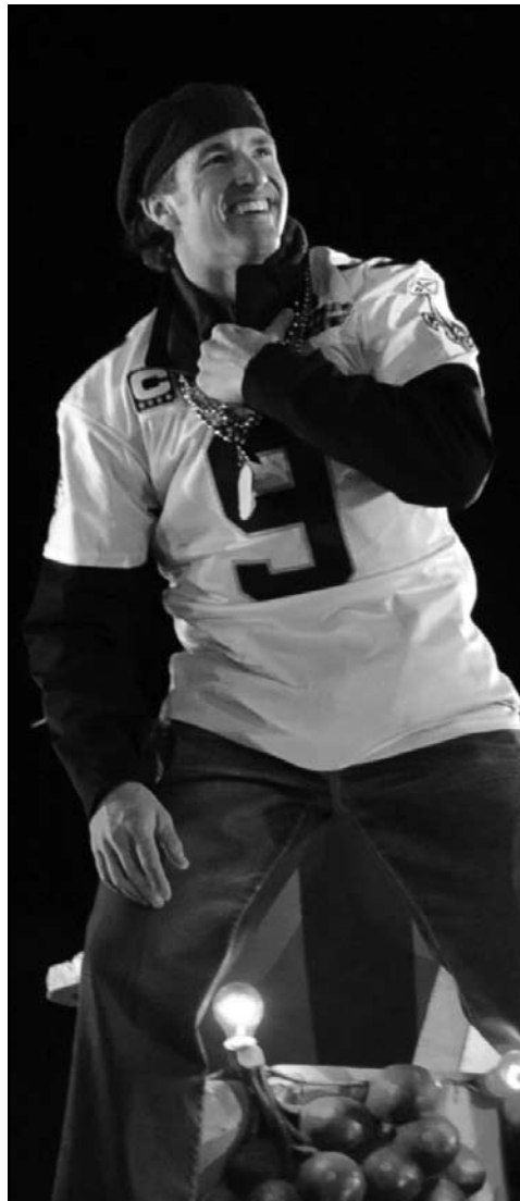
Saints QB Drew Brees