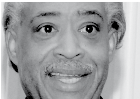
Rev. Al Sharpton NNPA Columnist

It was the second annual convention of the Medical Committee for Human Rights in 1965. And during this conference in Chicago, our great civil rights leader, the Rev. Dr. Martin Luther King Jr., delivered a speech that till this day resonates with those who see disparity in our health care system. It was on March 25 – precisely 44 years ago – that MLK said: “Of all the forms of inequality, injustice in health is the most shocking and the most inhuman.” To the 220 members of Congress who voted yes for health care reform on Sunday, the citizens of the United States at long last say thank you for representing our desires,