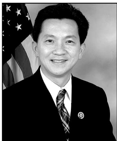
Congressman Anh "Joseph" Cao (LA-2)

Cao, who was the sole Republican to vote in favor of the House health care reform bill (H.R. 3962), said he could not in good conscience vote for the Senate version because the measure and a related presidential Executive Order are together and individu-