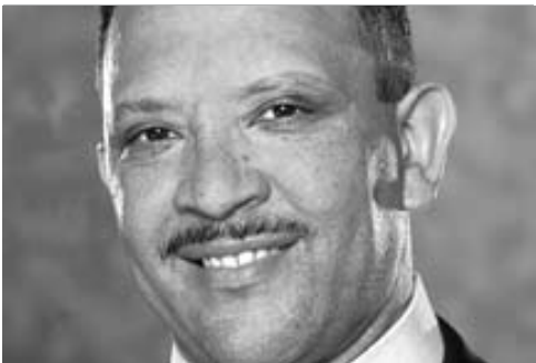
Marc Morial President and CEO National Urban League