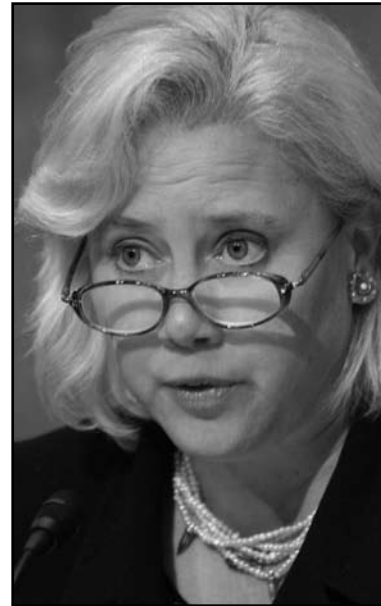
Senator Mary Landrieu