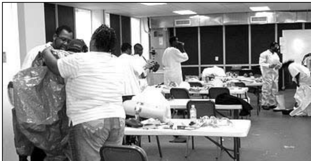
Clean up workers prepare to deploy to Gulf Coast to work on the Deepwater Horizon explosion disaster.

Tuesday, May 17, 2010 - Dillard University's Deep South Center for Environmental Justice (DU/DSCEJ) in partnership with Clark Atlanta University's Environmental Justice Resource Center, has conducted environmental remediation training for fifteen years through its Brownfields Minority Worker Training Program (BMWT) and Minority Worker Training Program (MWTP) under funding from the National Institute of Environmental Health Sciences (NIEHS). In recent weeks, the DSCEJ and affiliate programs have helped many of the program graduates