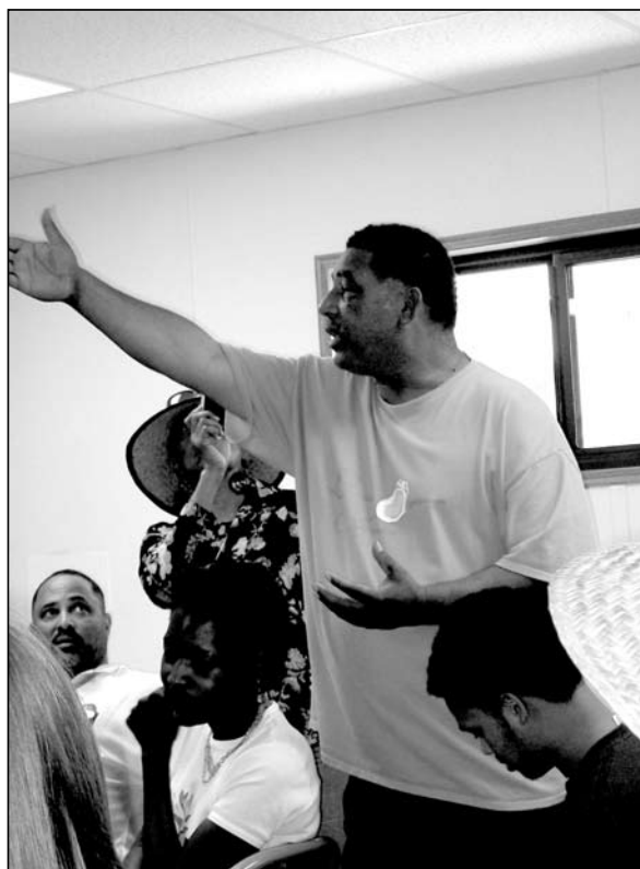
Blacks from the area who have made a living on waters now see their way of life in jeopardy