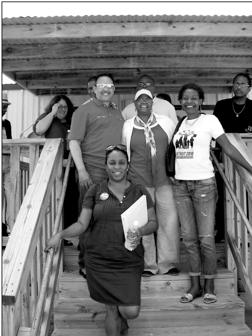
National Urban League President Marc Morial surrounded by supporters of minority oystermen and fisherman.