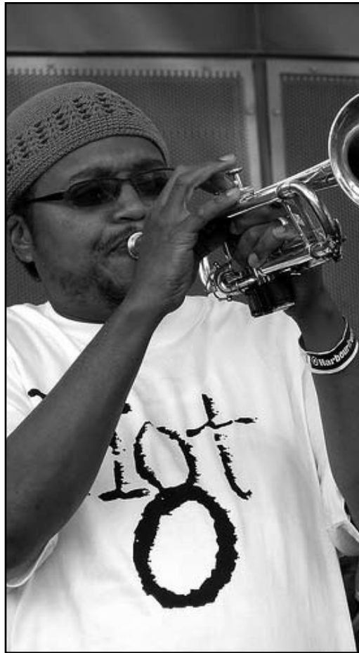
Hot 8 Brass Band

Make sure to check it out and support our local treasures as they step up to hold it down for the NOLA!