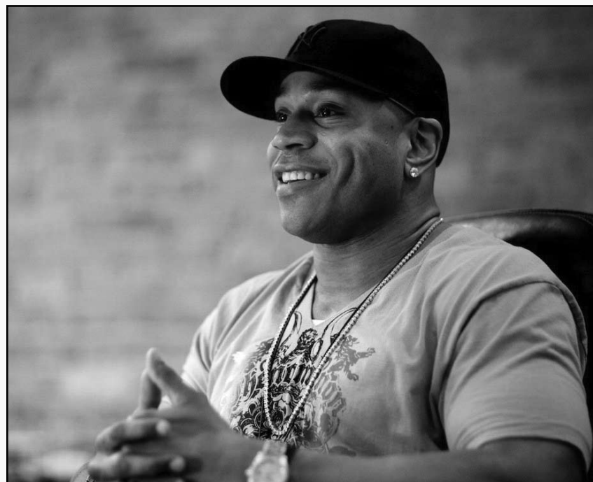
LL Cool J