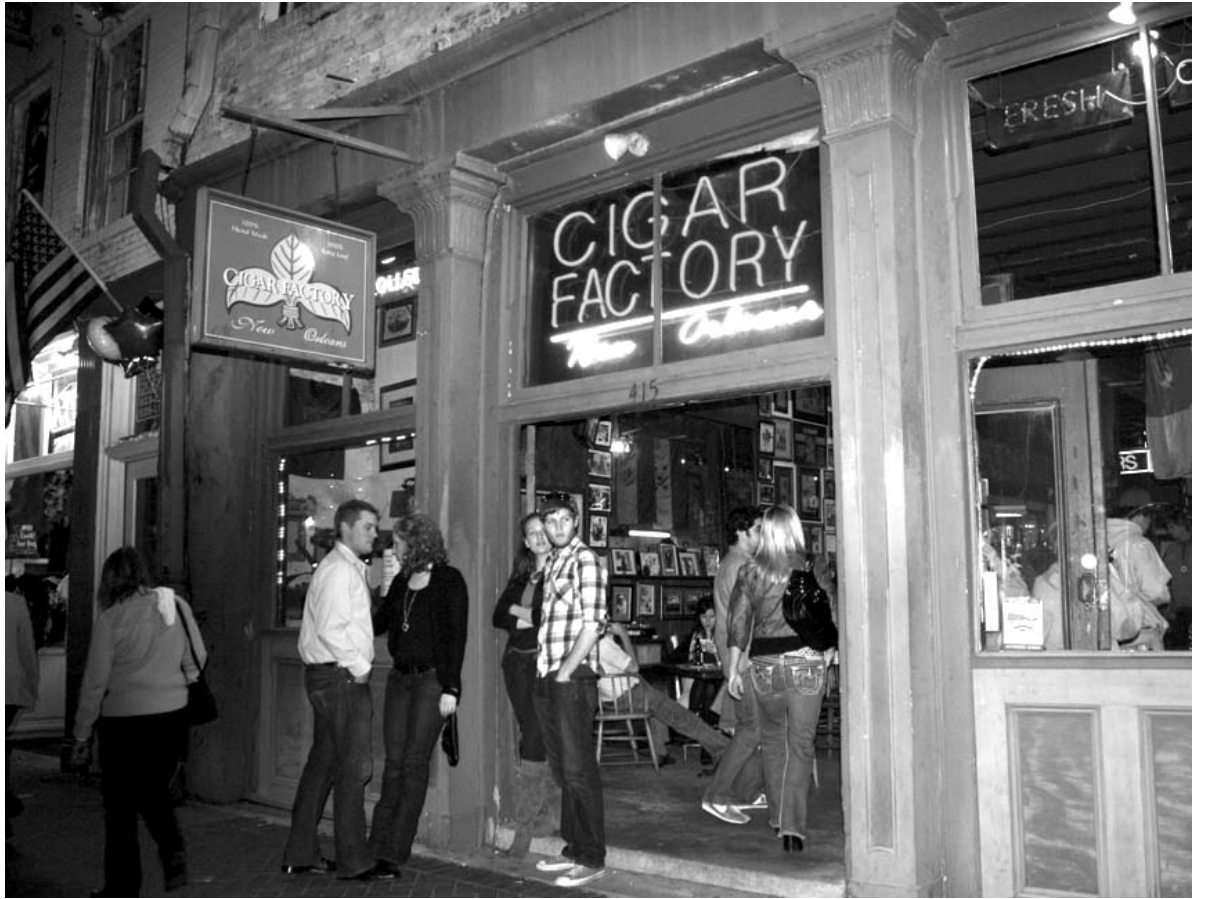
The New Orleans Cigar Factory allows patrons to experience the rich history of New Orleans

work. With a second location on Bourbon Street, the factory produces over 30,000 cigars a month, and has clientele from all over the world. Many out-of-towners visit the shop to stock up on their supply, or to have a few boxes of their favorite stogie mailed home. But residents of the city can discover that taking advantage of this local gem would not be a bad idea at all. In fact, through some of the many visits I made there, I discovered that the flavor infused Vanilla Sweet Panatela was a perfect match. There's actually a cigar for everyone there. For the occasional cigar smoker like myself, smooth, mild cigars like the Panatela can satisfy my taste. The selection, however, is extensive and any cigar lover can find a match for their taste in tobacco. New Orleans Cigar Factory also provides cigar rolling for private events and functions. For more information, log on to www.cigar-factoryneworleans.com or call (504) 568-1003