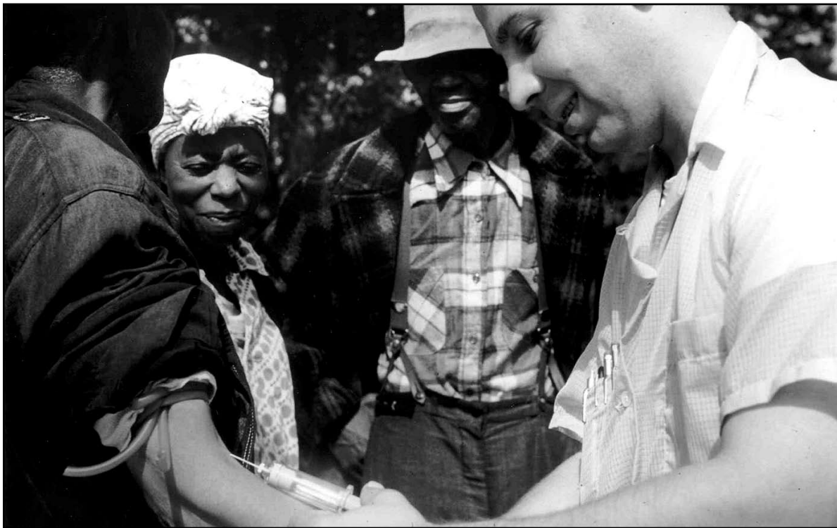
Blood being drawn from victim of Tuskegee syphilis study.

certain diseases and their response to therapy is dependent upon a person's genetic makeup," said Liggett, who works in pharmacogenetics, the relationship between a person's genetic makeup and their response to drugs. "The African-American community represents a unique genetic makeup that must be considered when one is designing a clinical trial. For example, we would need to know if a treatment for high blood pressure really works to save lives in those of African descent, of Asian descent, of European descent, etc. Otherwise, what will happen, and this is unfortunate, if a trial gets approved but doesn't have proper ethnic representation, once it's approved, it will be prescribed to everyone."