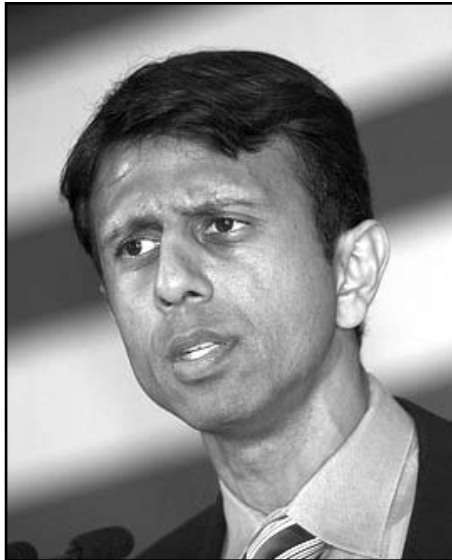
Gov. Bobby Jindal

Governor Jindal said, "These clinics have set a standard not only for our state, but for the country, in how we can provide primary, preventive and behavioral health care to citizens in their communities without forcing them into emergency rooms for non-emergency care. They continue to play a vital role as we continue to re-