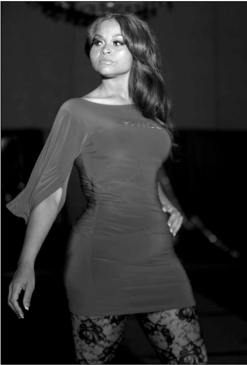
Model Monique B is happy with her results after undergoing gastric bypass surgery. She feels better, is healthier and happier than ever