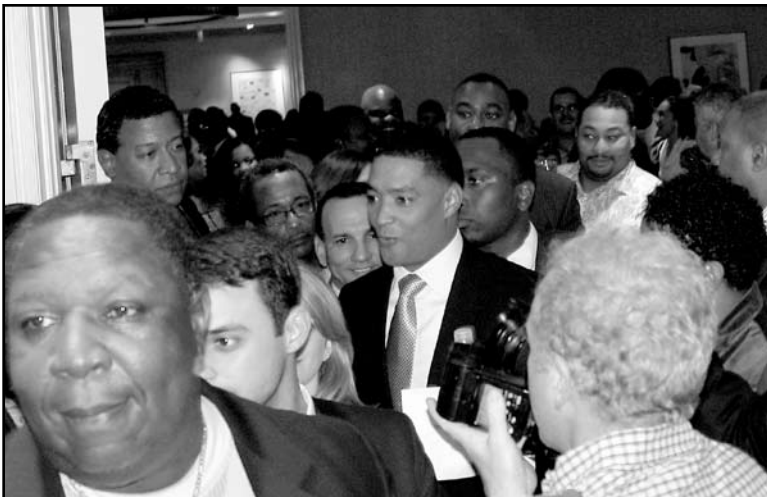
Congressman Richmond greets supporters at his victory celebration