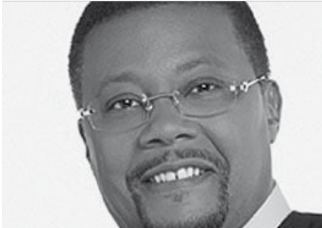
Judge Greg Mathis NNPA Columnist