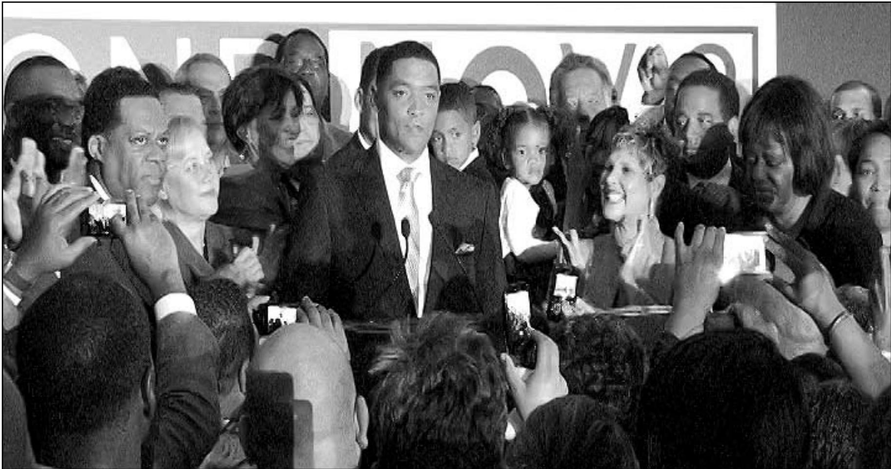
Congressman Cedric Richmond gives his acceptance speech as the newly elected member of the U.S. House of Representatives for the 2nd Congressional District.