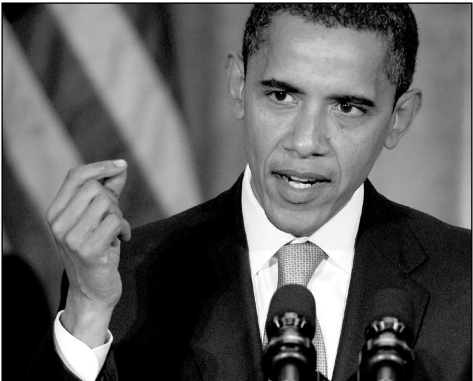
United States President Barack Obama