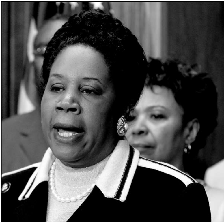
Congresswoman Sheila Jackson Lee (D-Tx)

Congressional Black Caucus member Sheila Jackson Lee of Texas suggested to members of Congress that President Obama is being treated unfairly in debt negotiations because of his race.