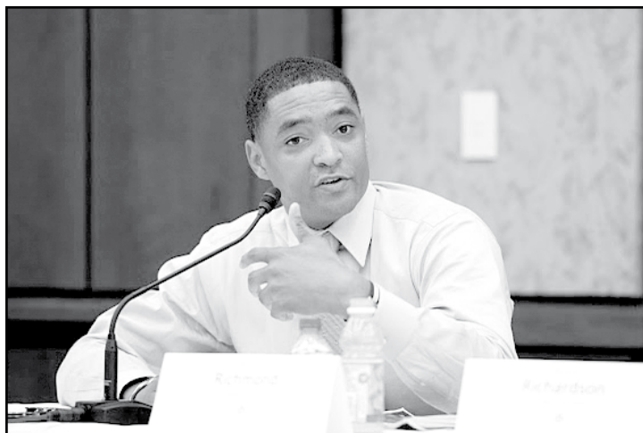
Congressman Cedric Richmond (D-LA)

The economy has recently hit a stand still. Federal fiscal and monetary stimulus programs are winding down. Banks continue to lend at an anemic rate to small businesses, as loans outstanding to small firms dropped 2.4% in the first quarter. The May unemployment report concluded that the economy added only 54,000 jobs. In light of these developments, it is clear that now is the time to invest in a more sustained, broad based recovery. I have two specific ideas that will help accelerate the slow growth the country has experienced. First, we must respond to emergencies in our districts as they arise. Second, we must invest in dredging by the Army Corps of Engineers to support increased commercial activity on our nation's waterways. By taking these simple steps, we can work to restore our communities and create jobs. Right now, every state in America is under some sort of disaster declaration and is receiving Federal disaster dollars. Every state in America currently has an active Federal Emergency Management Agency office operating in its borders. Congress must respond to the needs of Americans as they arise by investing in disaster recovery. We must immediately invest in the economic revitalization of areas that have been hard hit by the deadly combination of disaster and recession, so families can rebuild and small businesses can create jobs. As our communities rebuild their local economy and infrastructure, the Republican leadership in Congress has a