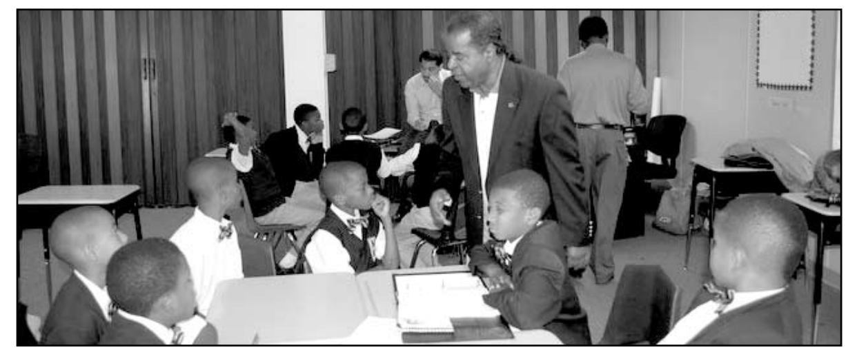
Collegiate 100 Black Men of Dillard University and the 100 Black Men of Metro New Orleans came together to mentor at Miller McCoy.