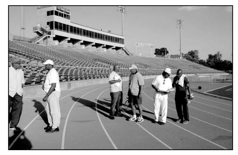
100 Black Men of New Orleans Event volunteers at City Park for the Tommie Smith Youth Track Meet.