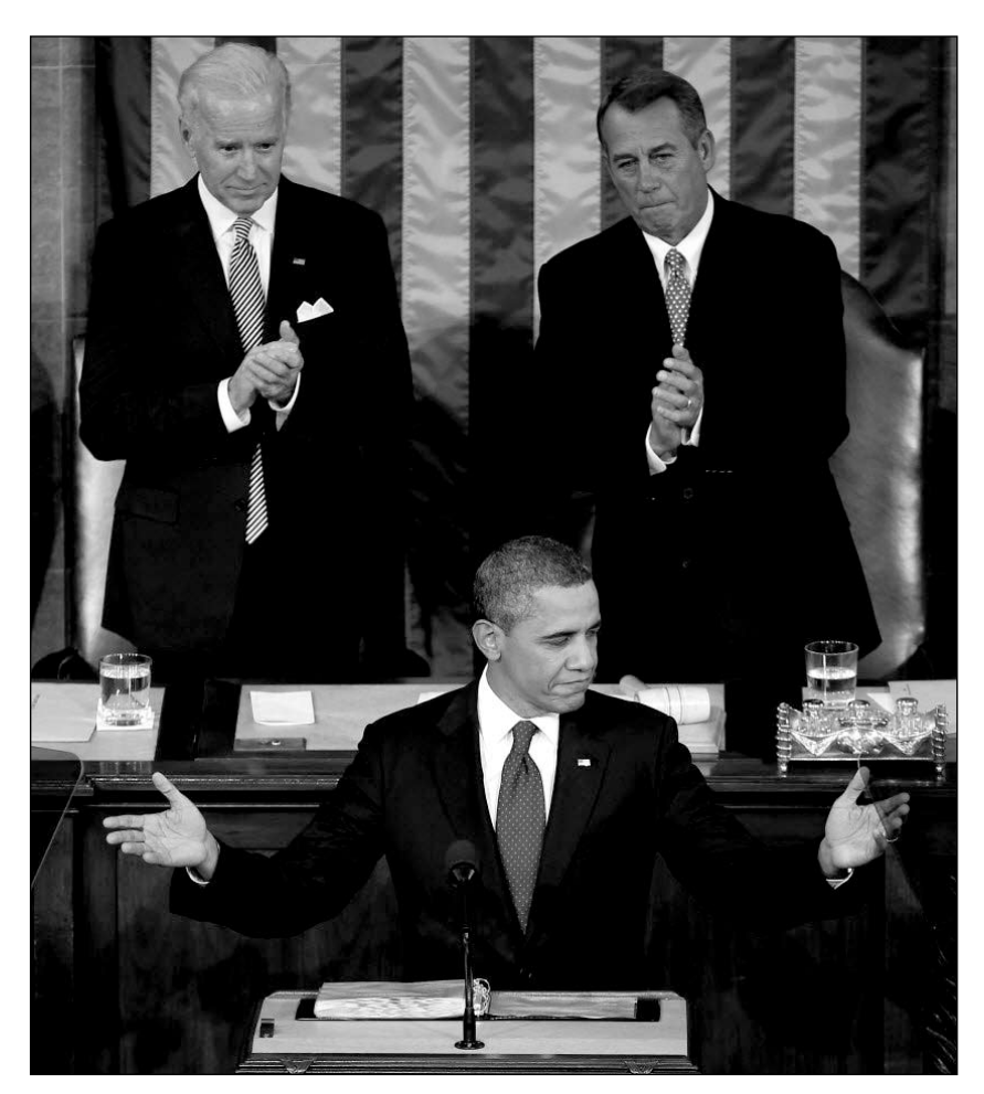
President Barack Obama addresses the joint session of Congress at the 2012 State of the Union Address.

Cover Story, Continued from previous page.