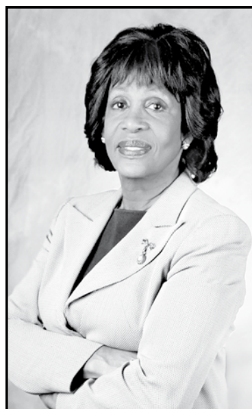
Rep. Maxine Waters (D-Calif.)

"Nobody wants to come to the defense of a member of Congress, even if that member