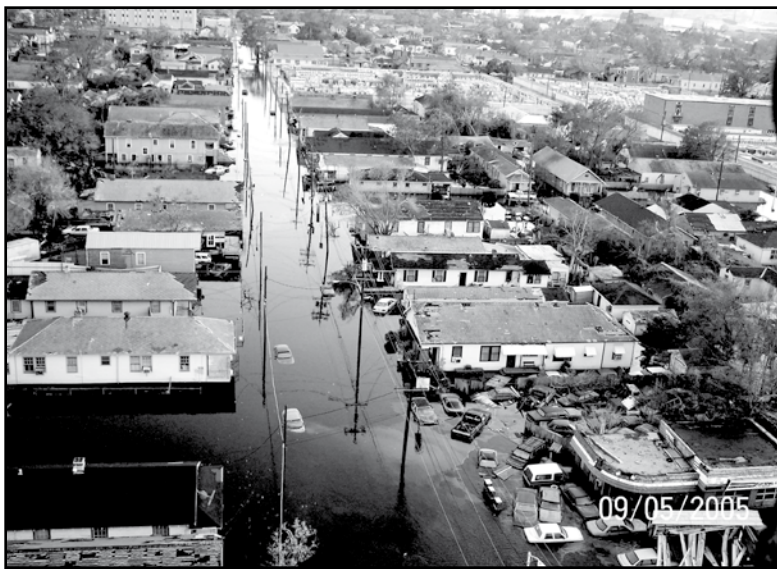
Thousands of houses in New Orleans, Louisiana with the downtown skyline in the background remain under water one week after Hurricane Katrina went through Louisiana, Mississippi, and Alabama September 5, 2005.

The 5th Circuit decision reverses a 2009 ruling by U.S. District Judge Stanwood Duval Jr. in New Orleans, who found that the federal government did not have immunity from lawsuits arising out of Katrina's