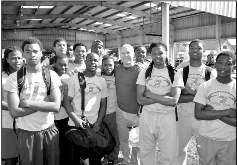
NOLA 4 Life day at McDonogh Park in Algiers