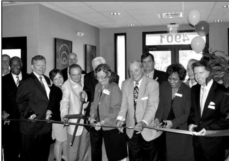
First NBC Bank officials and community leaders cut ribbon at the Bank's new General DeGaulle Branch located at 4901 General DeGaulle, next to Lakewood Golf Club in Algiers.

Children and their families that utilize Brechtel Park and Recreation area in Algiers received some good news from a local community bank.