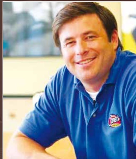
Todd Graves Raising Canes