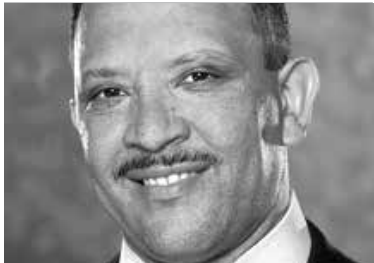
Marc Morial President and CEO National Urban League

Acts of terror like the ones committed in Boston last week are reprehensible and without moral or logical explanation. They rock us to our core. They also unite us in common purpose. Victims and their families seem to become our own. We want to ease their pain. We want to do something to ensure that this doesn't happen again. Our togetherness as a nation is often most evident when something happens with the intent of breaking us.