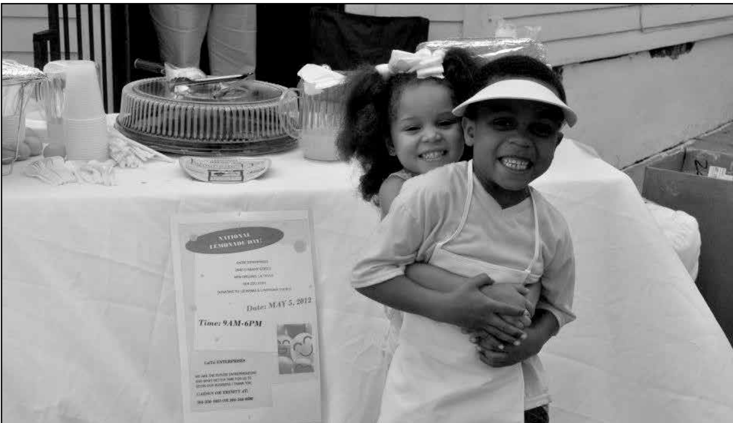
This year, Lemonade Day organizers expect to have over 15,000 children participate in Lemonade Day Louisiana 2013.