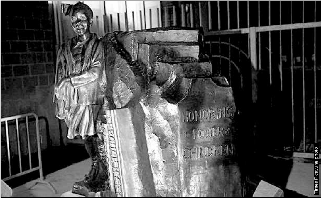
Honoring the Power of Children Statue was unveiled on Friday, November 15, 2014 at the William Frantz Elementary School in the playground area, a playground that Ruby Bridges never played on that first year.

Ruby Bridges, a Civil Rights Icon, Exemplifies the Power of Children