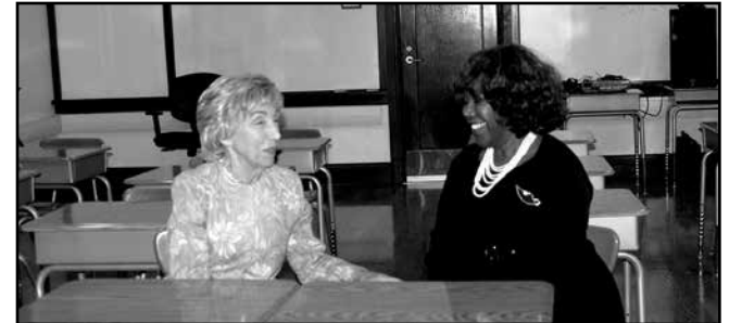
Ruby Bridges and Barbara Henry revisit the second-floor classroom where they sit together at desks. As Ruby was her only student Mrs. Henry chose to sit beside her and teach.