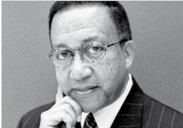
Benjamin F. Chavis, Jr. NNPA Columnist

One day, when the glory comes It will be ours, it will be ours Oh, one day, when the war is won We will be sure, we will be here sure Oh, glory, glory Oh, glory, glory